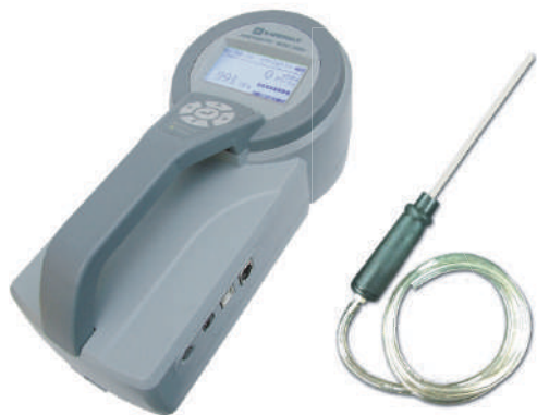
Handheld CPC Model 3800

Condensation particle counters (CPCs) are the primary tool for measurement of nanoparticles as they can detect particles as small as 15 nm and as large as 1 \mu\text{m} . Traditional optical particle counters (OPCs) are also useful tools for nanoparticle studies as they can detect larger agglomerated nanoparticles not seen with the CPC.