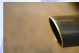
Engine exhaust testing