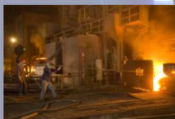
Checking worker exposure to airborne contaminants